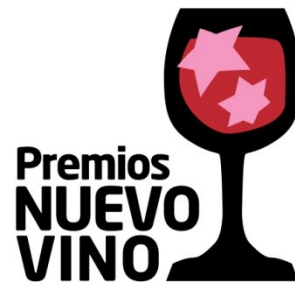
INTERNATIONAL new wine awards